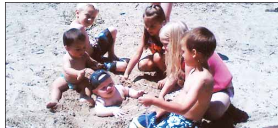
The Rocky Point Beach isn't just for lying on. It's also for being buried into. That's one way to keep the non-swimmers safe.